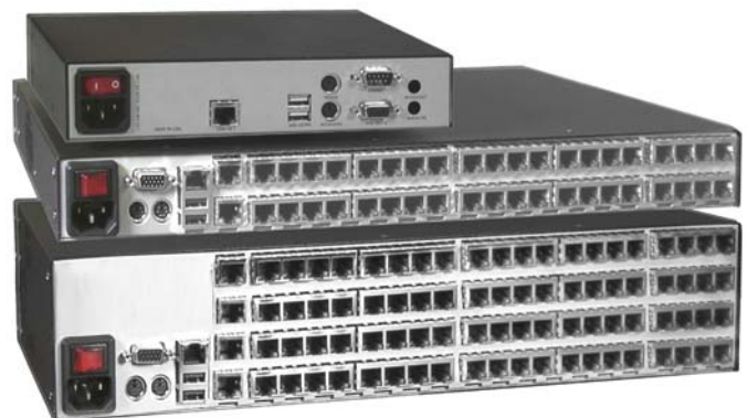
(User station / 8 x 32 / 16 x 64)