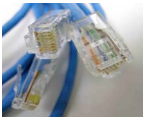
CATx connections make for easy, quick installation

As the inventors of the KVM switch, Rose continues to provide leading solutions for your server management needs. With headquarters in the US and offices in Europe and Asia, Rose provides a full range of capabilities and support. Call us today for more information about this and other Rose products.